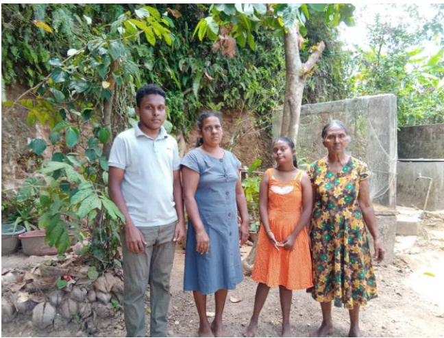
With his family

The weight of being the only male member to look after four female family members, two of whom have special needs, has led to a noticeable state of mental exhaustion. It is clear that he is not in a position to dedicate himself to studies as he once did, as the shock of the tragedy and the family's precarious future weigh heavily on his mind.