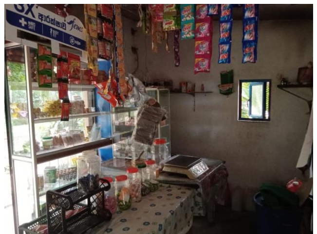
mothers' small shop